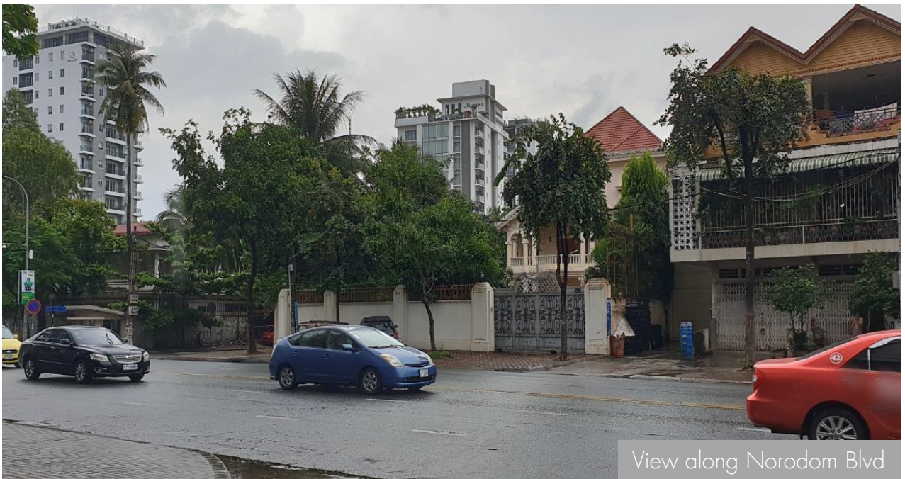
View along Norodom Blvd