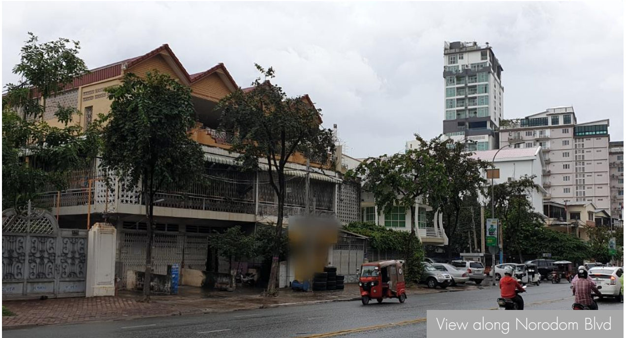
View along Norodom Blvd