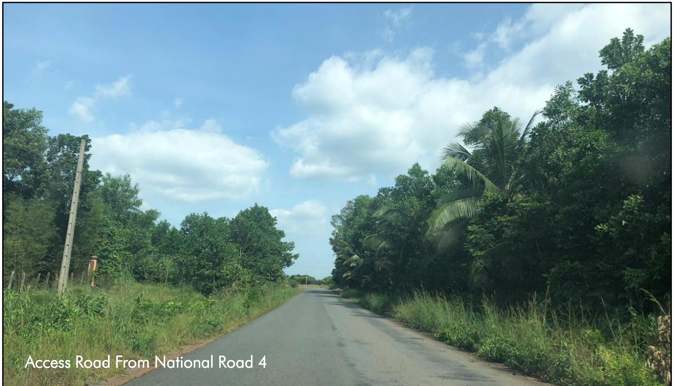
Access Road From National Road 4