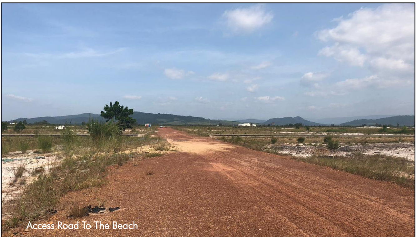
Access Road To The Beach