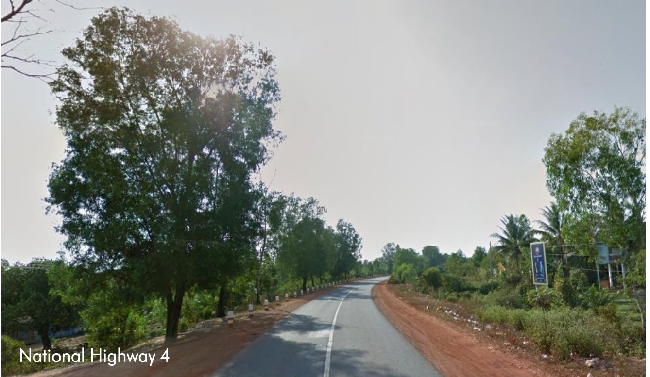
National Highway 4