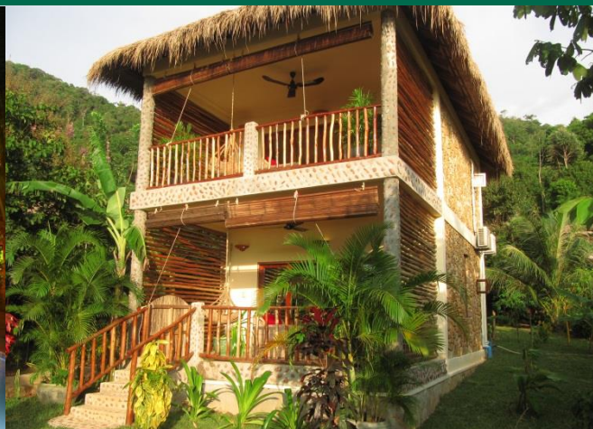
DELUXE FAMILY VILLA