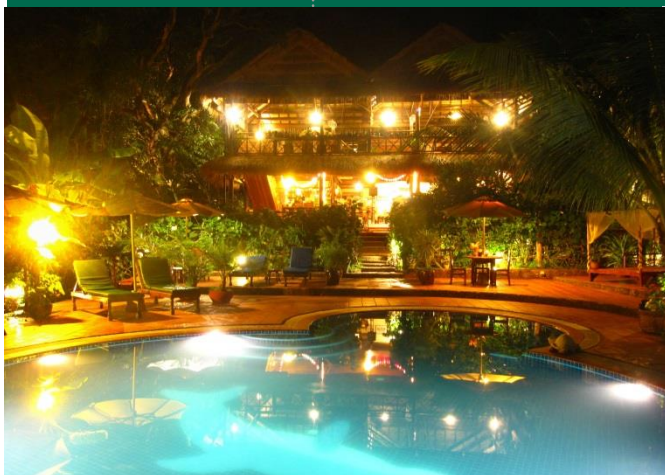
RESTAURANT FRONT NIGHT